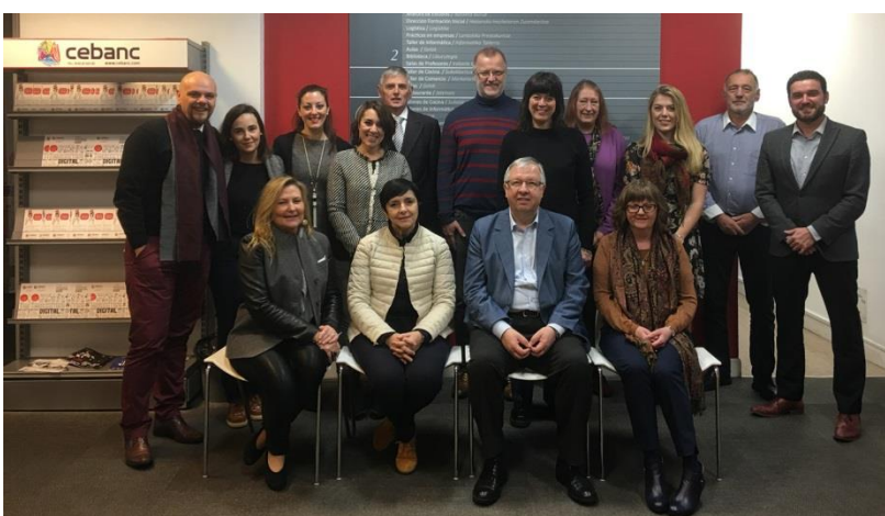
The project team at first meeting in San Sebastian

This project will target this huge market, with potential for entrepreneurs and start-up businesses, as well as growth areas for existing businesses. Students of hospitality and tourism and other studies which include customer service will also be part of the target group.